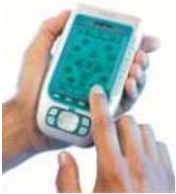
IR Programmable LCD Touch Screen Remote Control or PDA