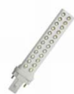
PLC LED Bulb