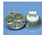
3Wx3 LED MR16